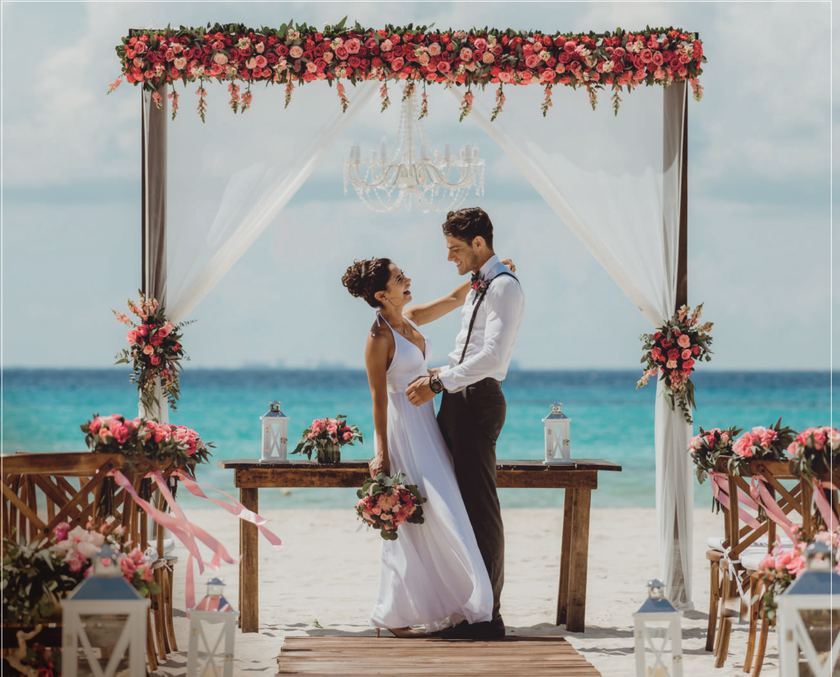
Illustrations may depict upgraded setups.